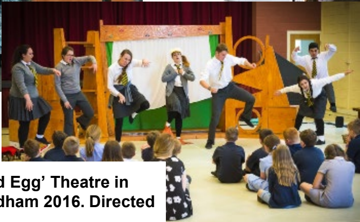
Photo of 'The Good Egg' Theatre in Education tour, Oldham 2016. Directed by Vicky Ireland.